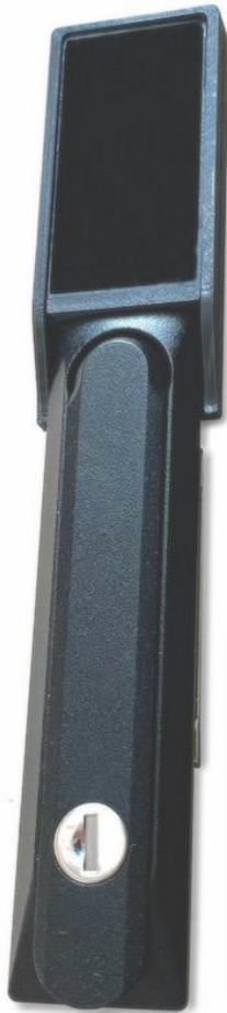
Electronic Door Lock With RFID Card Reader